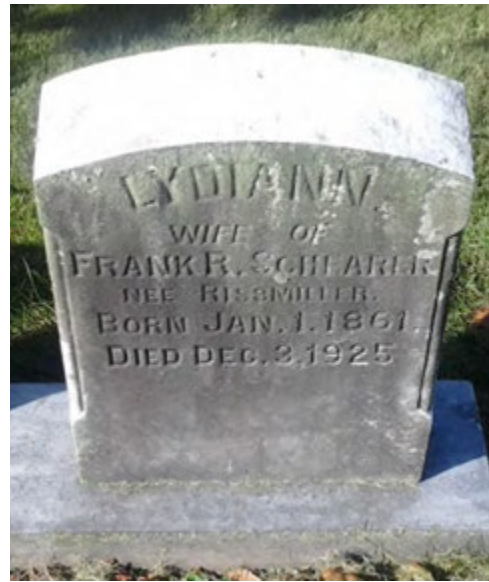
Lydia (Rissmiller/ Rauenzahn / Gift) Schearer