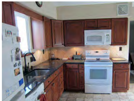
Kitchen "After" Photo!!!

NOTE: These Frequently Asked Questions are also available for viewing on my web site .